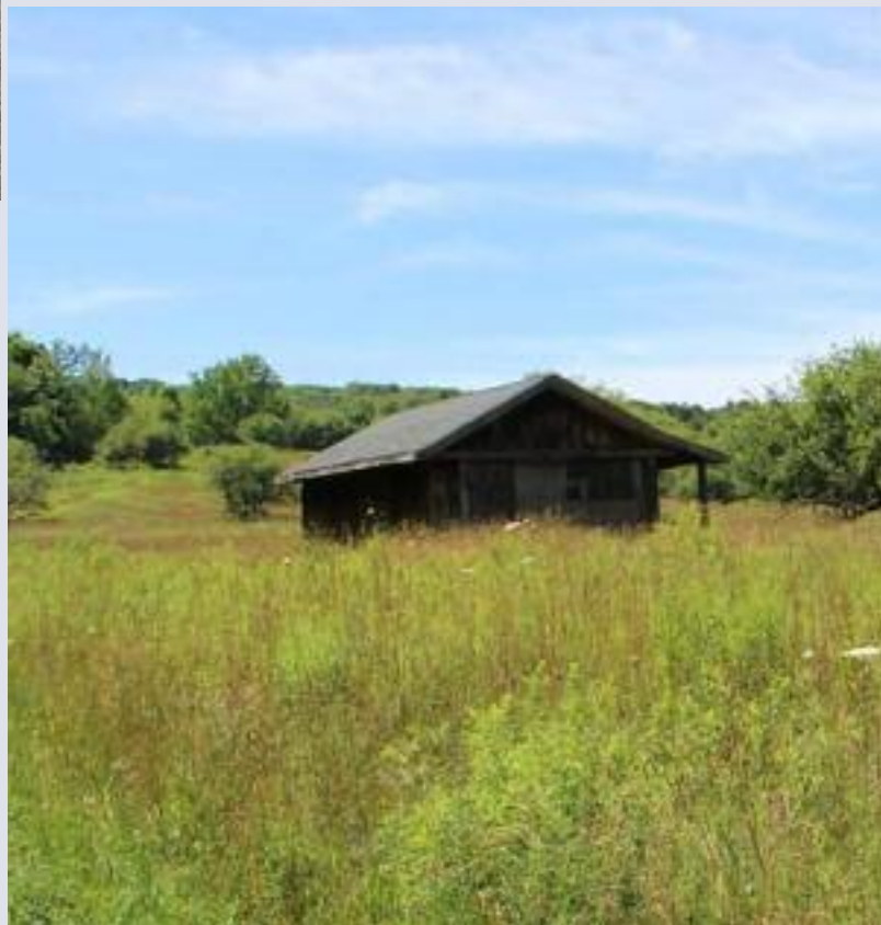
The Cider Shack sits in the former Merrick Orchard just off the Main Loop Trail in the Dundas Valley

Plans for the pavilion also include interpretive signage to explain the cultural and ecological significance of the area.