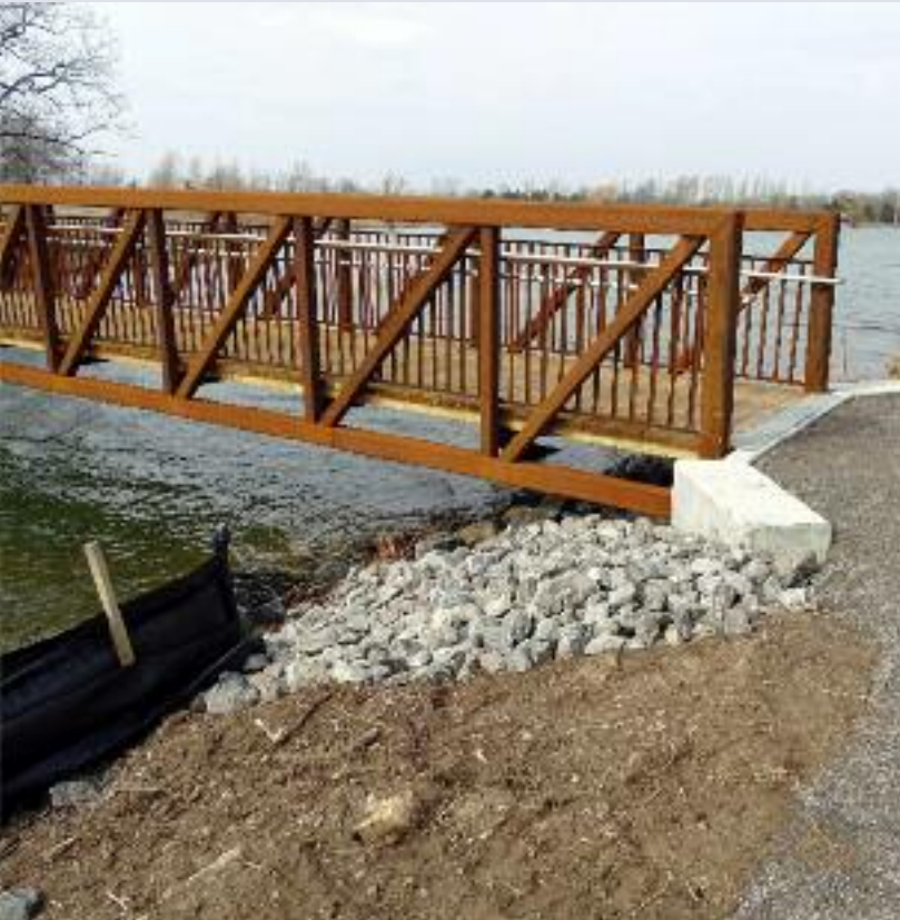
The centrepiece of the new trail loop is a bridge across the Fifty Point lagoon.

Known for its marina, beach and ball hockey facilities, Fifty Point is actually home to a thriving creek system winding its way out to Lake Ontario.