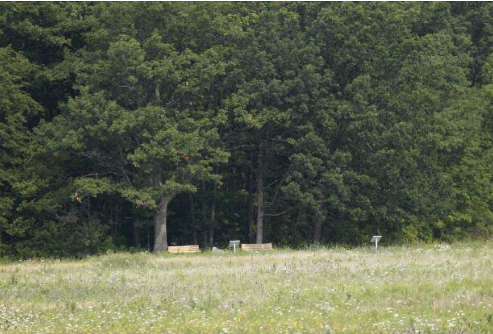
The new Conservation Area will sit immediately to the south-east of the Devil's Punchbowl CA (pictured)

Ultimately, the project will also provide a number of recreational opportunities including trails, interpretive signage and, of course, visitor parking.