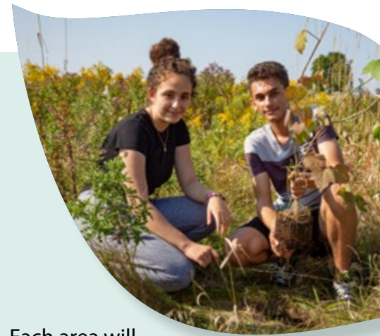
Native species planting at Eramosa Karst Conservation Area

These events were further supported by 50 volunteers, who came out to do the dirty work. Additionally, our Tribute Tree Program partner, Dodsworth & Brown Funeral Home-Ancaster Chapel, continues to provide annual funding for signage and tree plantings.